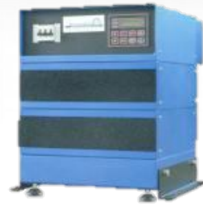
switch mode power supply

Software - solutions to customer's specification) Maintenance, repair and modification of all manufacturers Copper bus bar connections (to the process) Commissioning power supplies