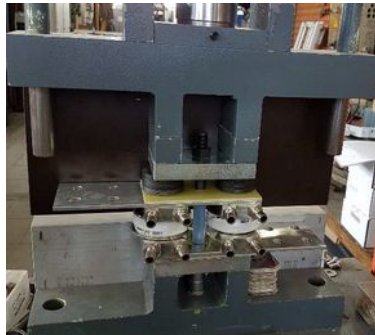
Diodes and thyristors