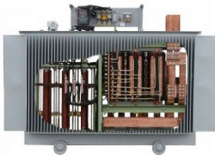
Oilcooled Rectifiers with or without regulating transformer

If the process needs a power supply suitable to high industrial standards, you will find your perfect power supplies made by IPS-FEST. Our high reliability and longevity are the features of our quality.